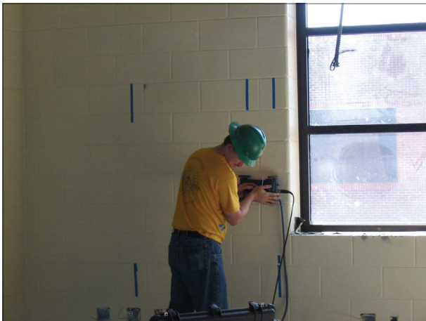
Making a Radar survey of a cinderblock wall...

Ground Penetrating Radar is a non-destructive evaluation technique used to accurately determine the precise location of potential hazards contained within the concrete.